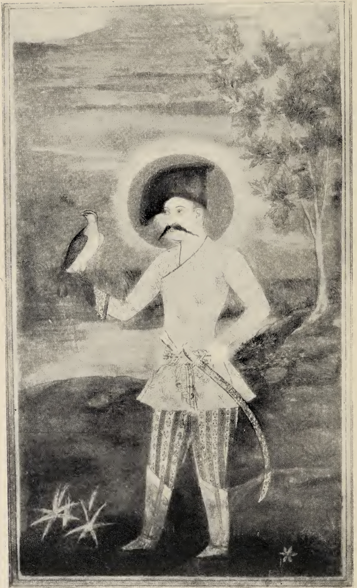
SHÁH 'ABBÁS THE GREAT